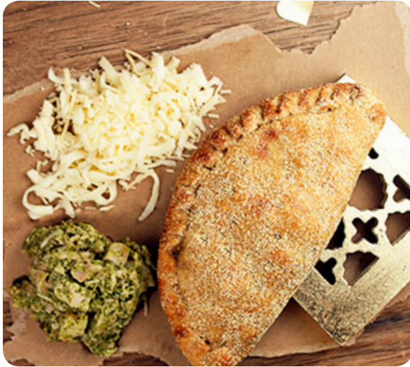
Chicken Pesto Pizza Pocket

Available Mondays Here's a handheld delight with a bit of a kick to it. Antibiotic-free chicken combined with our in-house cheese mix of Mozzarella, Parmesan, and Ricotta is stuffed into a whole grain pizza dough sleeve. The addition of Frank's Red Hot Original Sauce gives this pocket some pop.