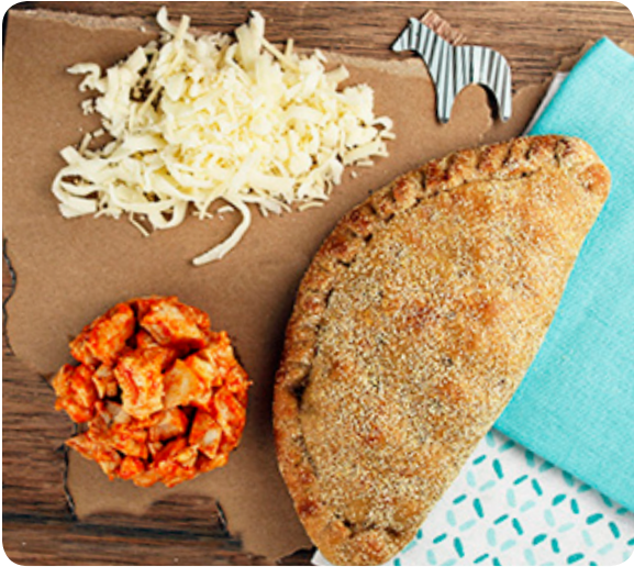
Buffalo Chicken Pizza Pocket

Available Mondays Here's a handheld delight with a bit of a kick to it. Antibiotic-free chicken combined with our in-house cheese mix of Mozzarella, Parmesan, and Ricotta is stuffed into a whole grain pizza dough sleeve. The addition of Frank's Red Hot Original Sauce gives this pocket some pop.