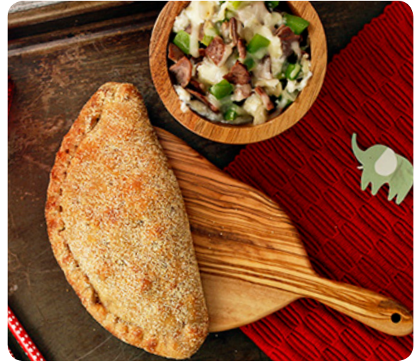
Philly Cheese Pizza Pocket

Available Wednesdays Flavorful basil pesto sauce leads the way in this simple but scrumptious entrée. Antibiotic-free chicken is mixed with our in-house, three-cheese combo and that pesto pizzazz in a whole-grain pizza dough pocket. Delicious!